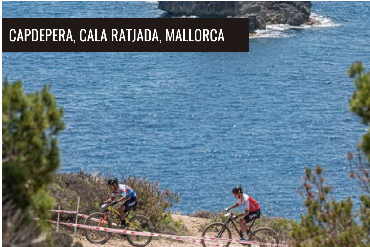
CAPDEPERA, CALA RATJADA, MALLORCA

And the last meeting before the stop will be on June 4, when the championship will travel to Mallorca to experience the spectacular Cala Ratjada meeting, rolling along the cliffs of Capdepera, which will continue to be UCI C1.